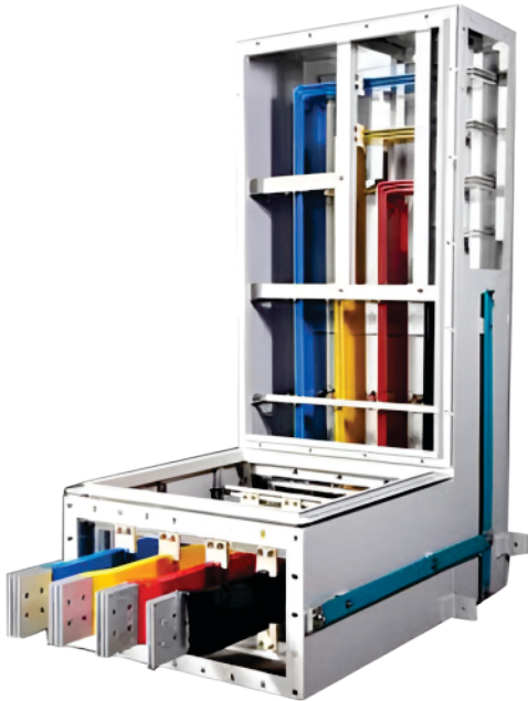
LT BUS DUCT